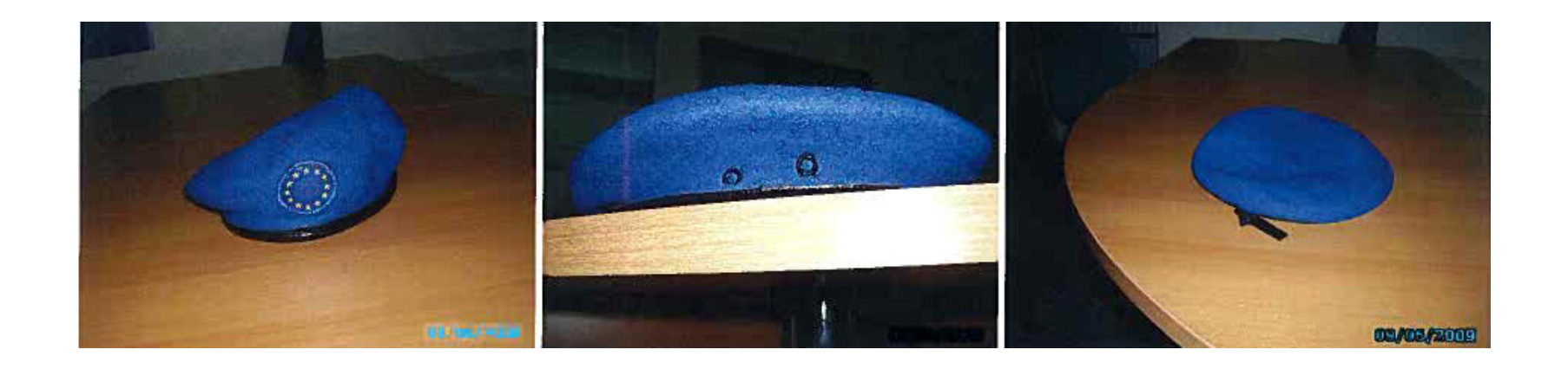
FIGURE 1 BERETS with BADGE (Refers to Lot 2, item 1 and 2)

Note: the following are additional specifications that refer to the designs, models, colours and dimensions of the requested items. The offered samples must strictly follow these additional specifications in conjunction with the technical specifications given above.