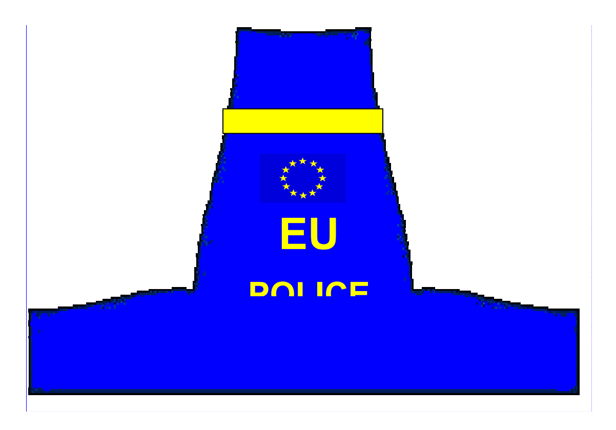
FIGURE 5 Correctional Service Armlet (Refers to Lot 3 Item 2)